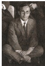
Tibor Radó, BB inventor

A small variation of the step counter function leads to the Busy-Beaver Problem: